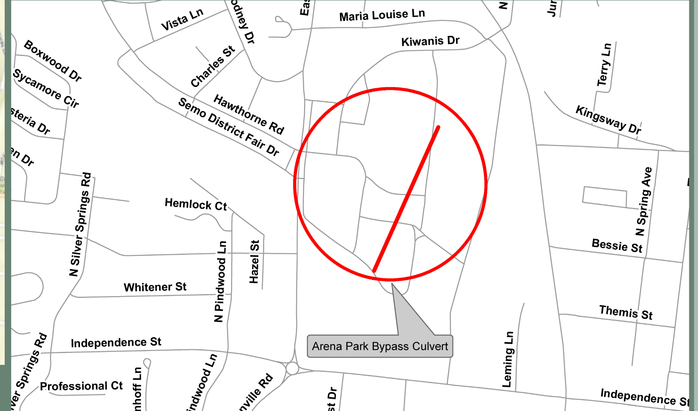
ARENA CULVERT LOCATION